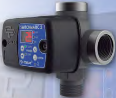
T-KIT SWITCHMATIC 2