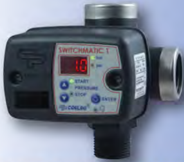
T-KIT SWITCHMATIC 1